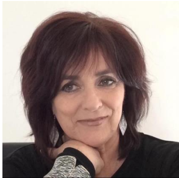
Minister Sandra Hickman of Australia

Words of Encouragement and Inspiration are coming from our ministry leaders: