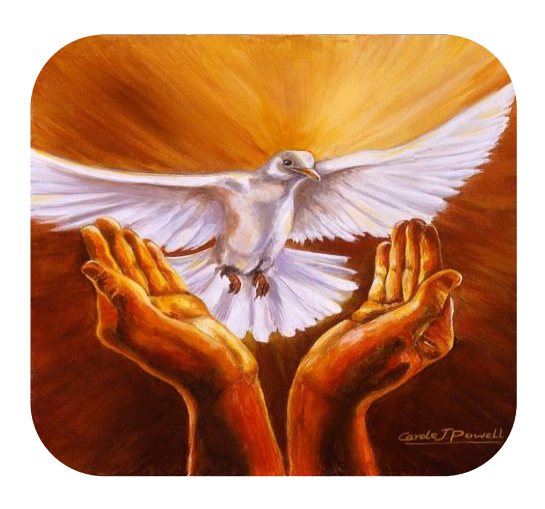
The Foundation of the Lamp Newsletter