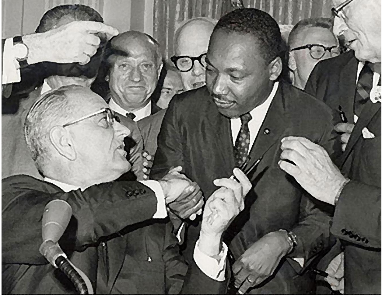
Dr. Martin L. King, Jr. with President Lyndon B. Johnson. In 1964, the official signing of the Civil Rights Act.

“The Civil Rights Act of 1964 (Pub.L. 88–352, 78 Stat. 241, enacted July 2, 1964) is a landmark piece of civil rights and US labor law legislation in the United States that outlawed discrimination based on race, color, religion, sex, or national origin.”