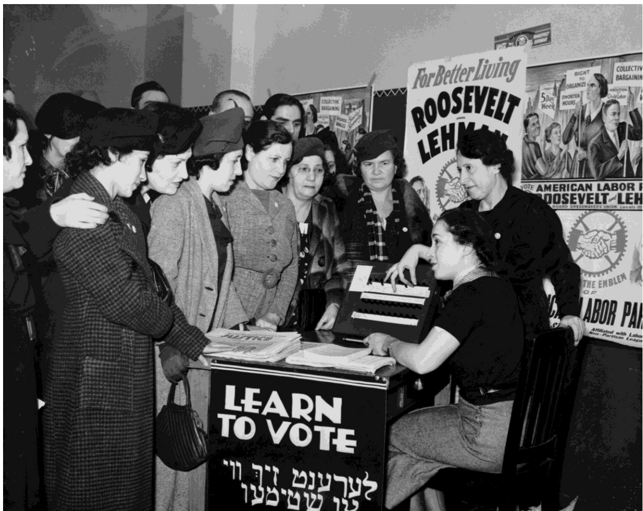
Women in America were truly grateful to have the right to vote.